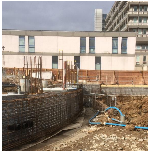
The start of a wall on the Baird site showing the curve of the building