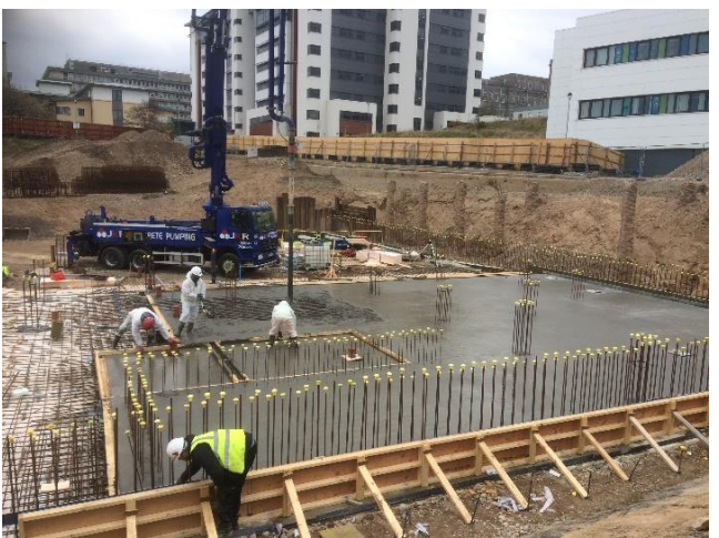
First concrete floor poured on the ANCHOR site

Radiotherapy building at ground floor level. These works are critical to allow other trades to carry out the work that they are responsible for. The steelworker has been busy making the reinforced iron cages which are then placed on top of the piles prior to concrete pours taking place.