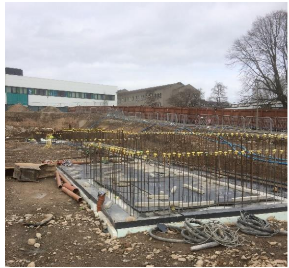
The beginning of a staircase on the ANCHOR site

Works are again progressing well; piling works have been completed and the piling rig is now off-site. A series of 'pile strength tests' have been carried out to ensure they are in compliance with the design engineer's data.